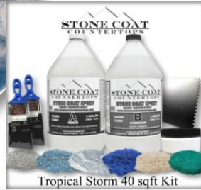
Tropical Storm 40 sqft Kit